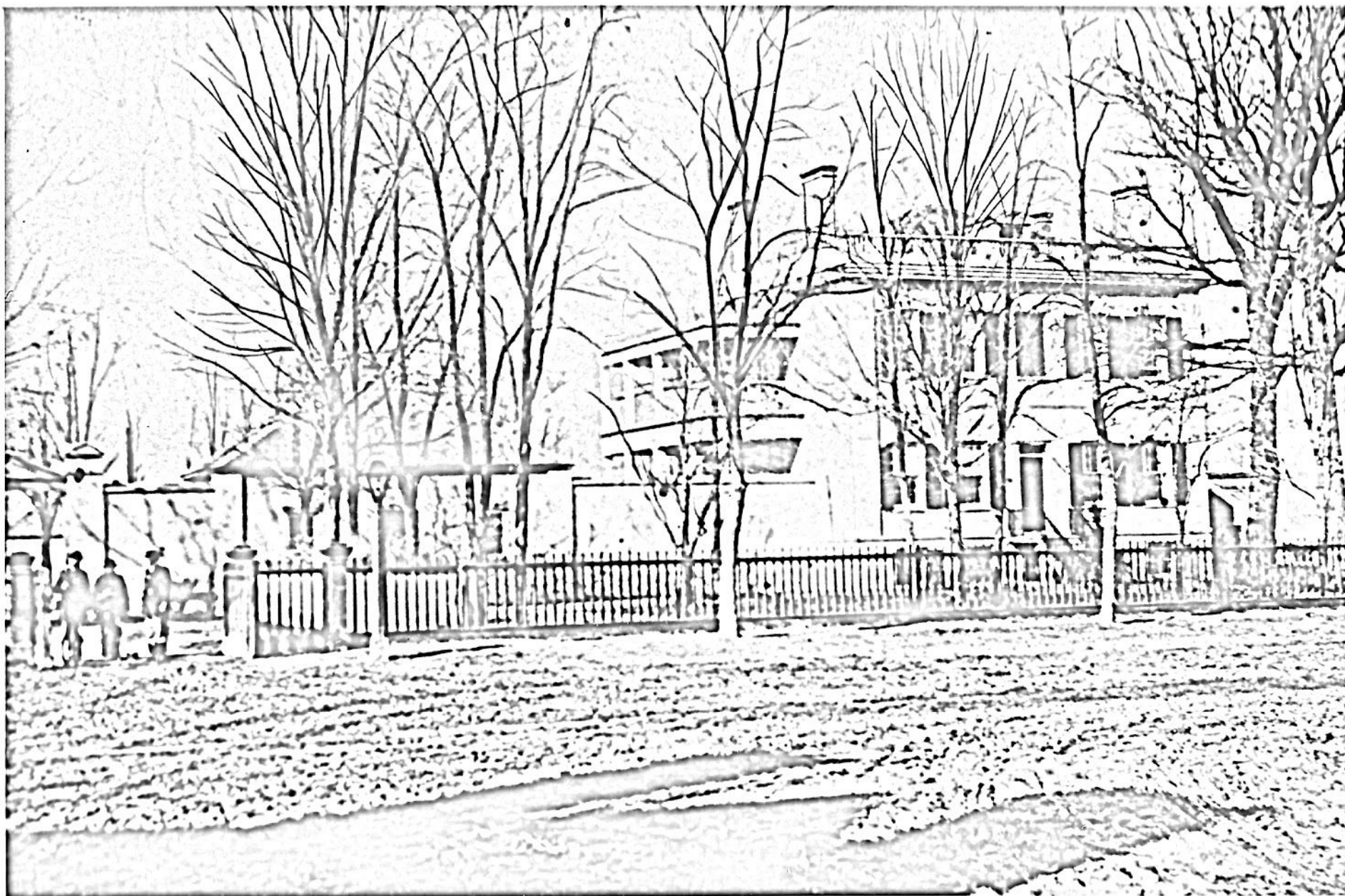
The Commandant's Quarters at 21950 Michigan Avenue was built in 1833 to be a home for commandants at the Detroit Arsenal in Dearbornville. This picture of the Commandant's Quarters dates to 1864, during the time of the Civil War.