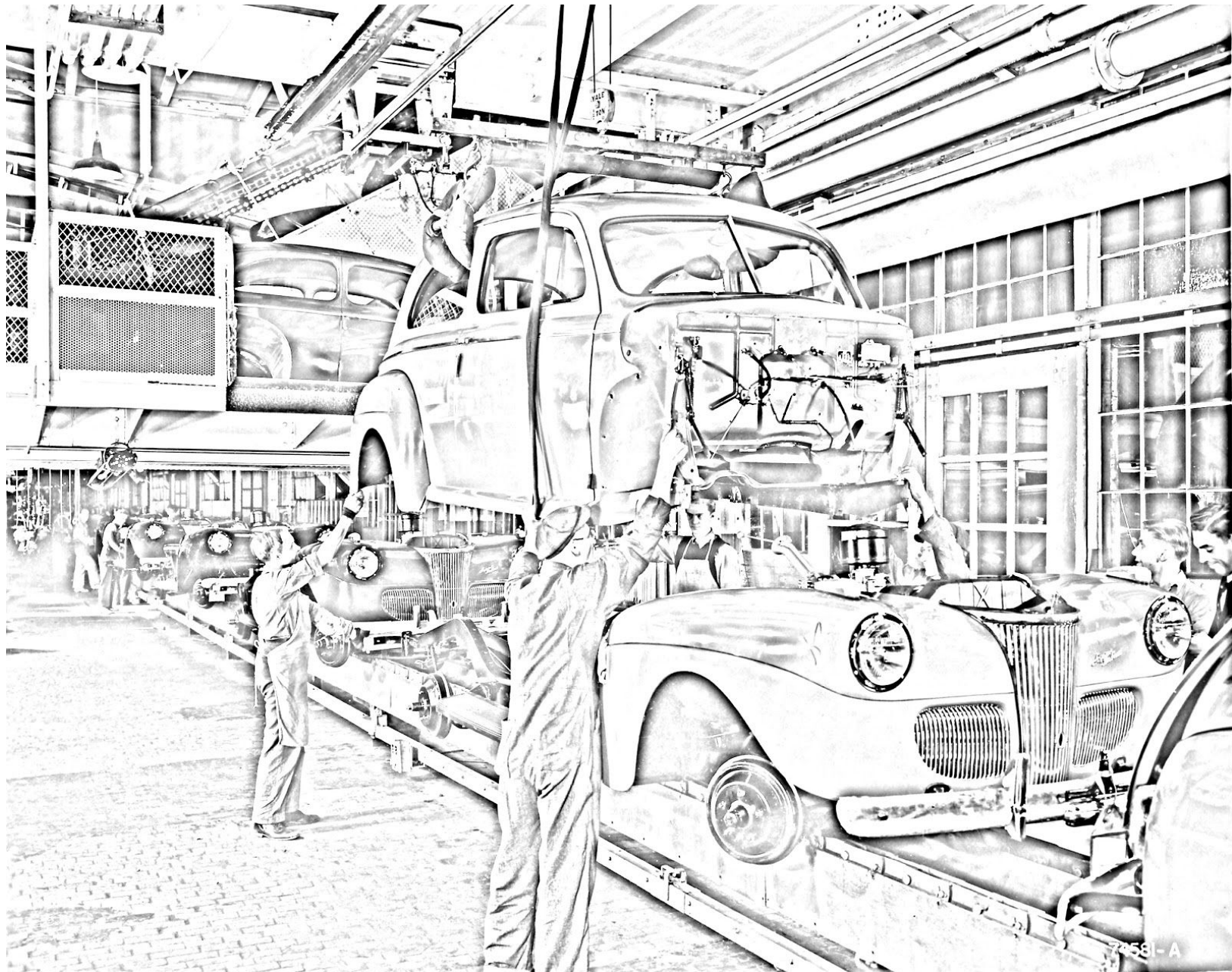
The Ford Rouge Assembly is a large automotive factory built in 1928. It is famous for producing so many vehicles and now offers tours showing how automobiles are made!