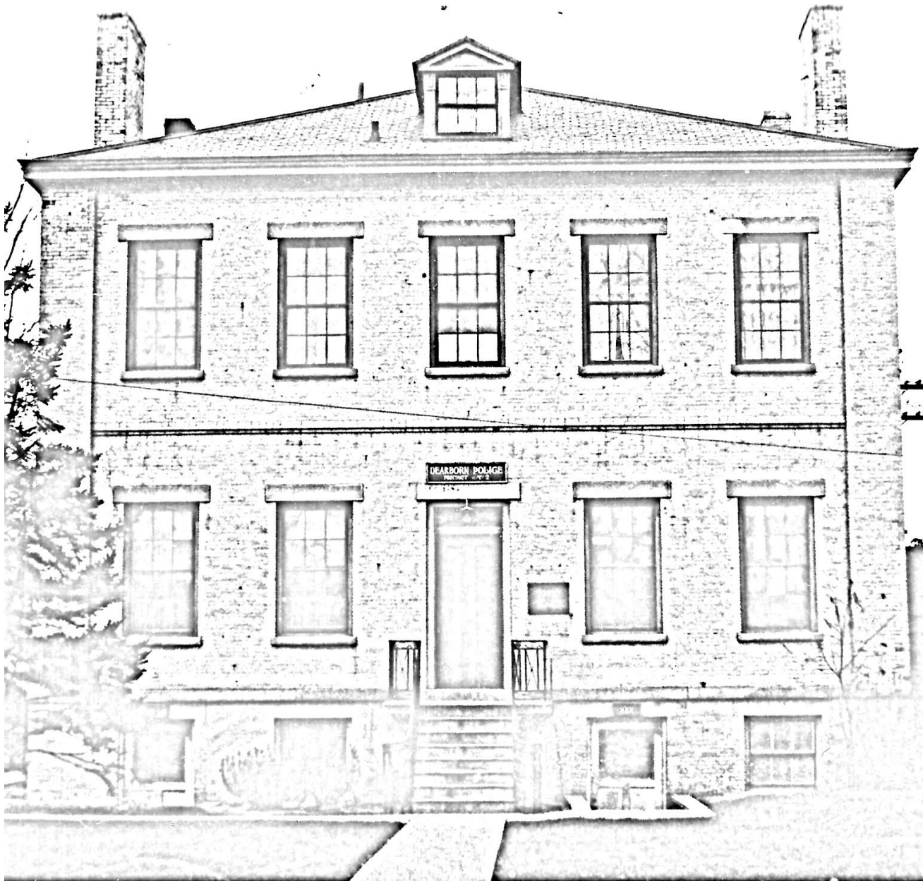
After the Civil War, the Arsenal was closed. The former Commandant's Quarters saw many uses over the years. In this picture from 1934, it is a police station.