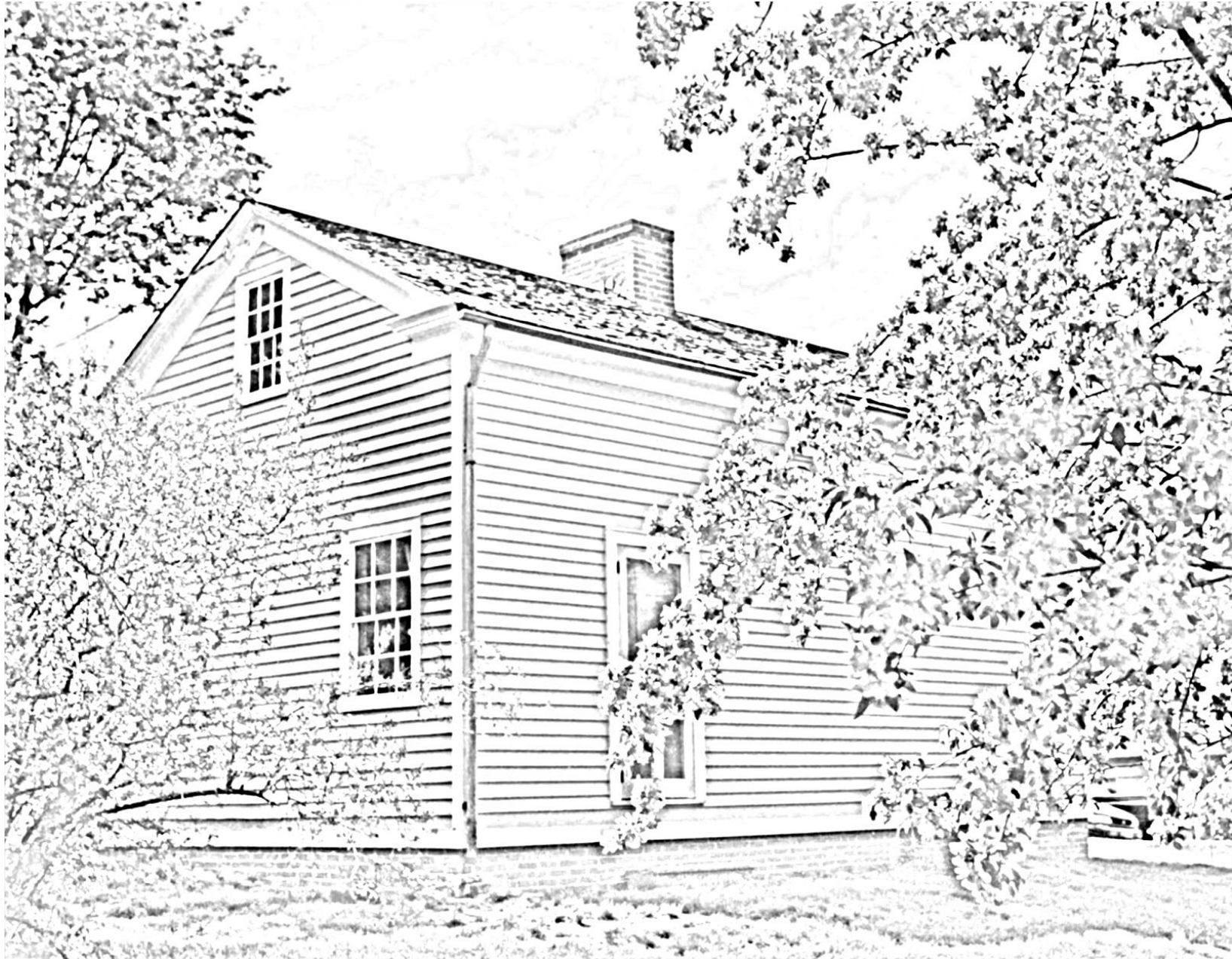
The Gardner House was built in the 1830s by early Dearborn settlers. Henry Ford would sometimes visit it when he was growing up. In 1929, the Gardner House was moved to Greenfield Village. In 1996, it moved to the Dearborn Historical Museum.