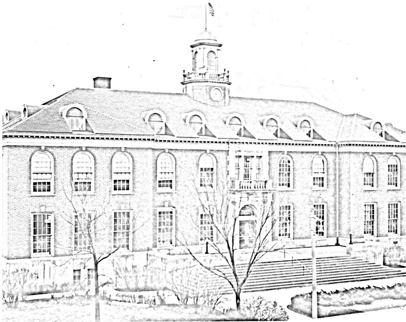
Dearborn's old City Hall (13615 Michigan Avenue) was built in 1921. This picture shows what it looked like during the 1940s. It is also listed on the National Register of Historic Places.