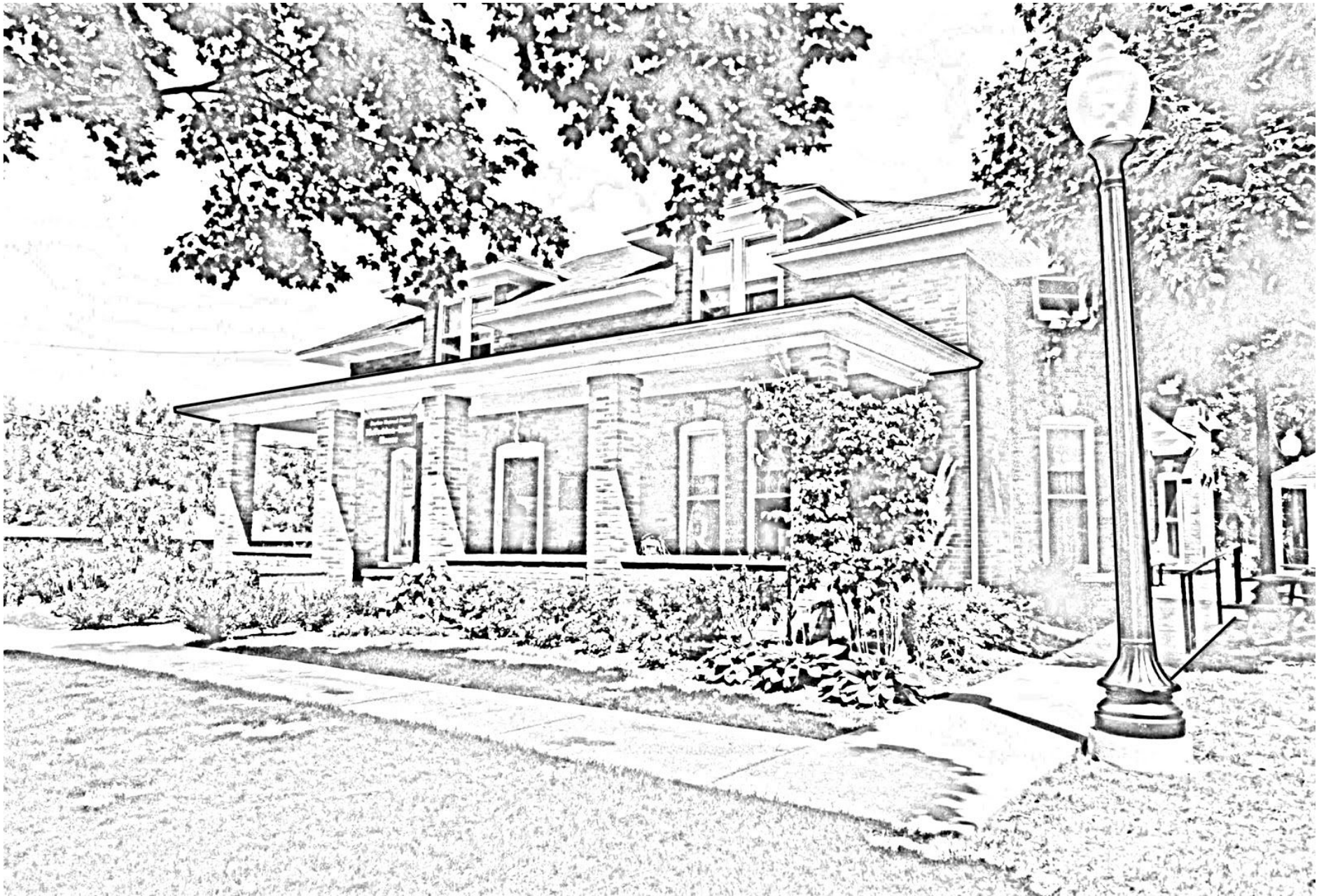
The McFadden-Ross House (915 S Brady) was originally built in 1839 to be the powder magazine for the arsenal in Dearborn. After the Arsenal closed, it became a farmhouse. Today, the McFadden-Ross House is part of the Dearborn Historical Museum.