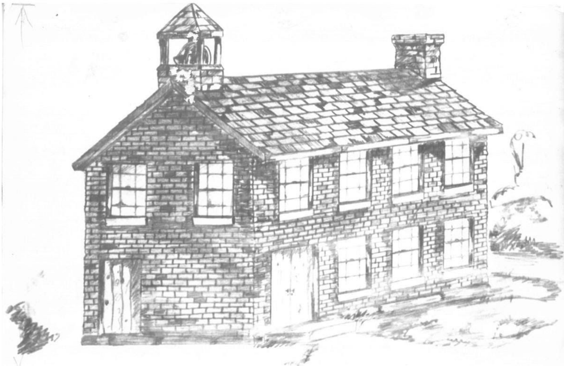
The Upstairs Downstairs School was Dearborn's only school building from 1857 to 1894. Much has changed since it was built! It was located on the west side of Monroe Street north of Garrison Street.