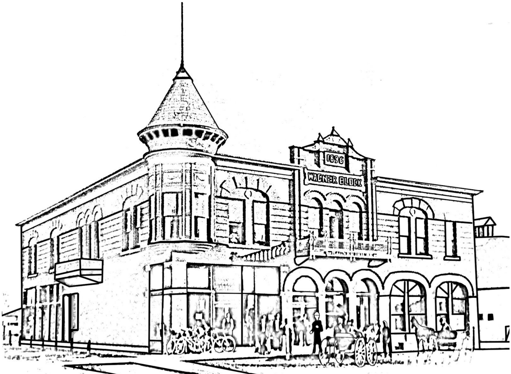
The Wagner Hotel (22011 Michigan Ave) was built in 1896 in the early days of Dearborn. Today, it has been renovated by Ford and is a modern office space.